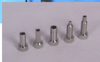
Offering various types of adapters for different applications