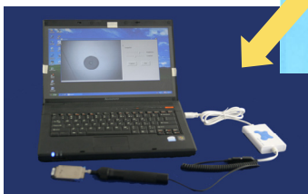
Using PC monitor