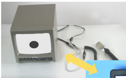
Using CRT monitor

FEI-20H can operate continuously for about 6 hours with built-in rechargeable battery, or run with external power supply. The microscope can also be connected to a LCD monitor, a CRT monitor, or a computer to view test result with our supporting software.